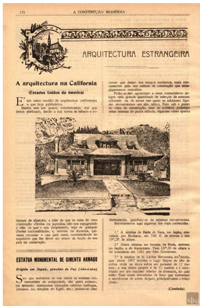
Figure 5. Article “A Arquitectura na California (Estados Unidos da America)” Published in “A Construção Moderna” in November 25, 1916.