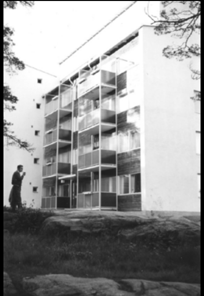
1-2 Alvar Aalto's Studio, 1957.