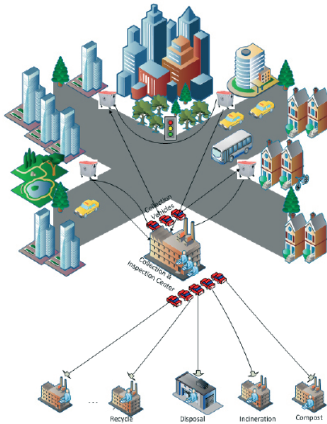
Fig. 2 - General diagram of the problem.

The problem is defined on a graph where the set of nodes consists of a depot and a disposal site which are considered as one node, customers and the set of arcs is. Let be the set of vehicles in VRP network and let be the set of types of waste and the types of centers that we will transport the classified waste after unloading them. It is assumed that all vehicles in VRP network can have different capacity. The objective of the WCVRP is to find a set of routes for the vehicles, minimizing total travel cost and satisfying vehicle capacity, such that all customers are visited exactly once and route of each vehicle, is chosen so that the similar trashcan be placed in one route. For this purpose, similar pattern was designed based on the probability of presence of the type of waste in trashcan, and dissimilarity is shown as a penalty in the objective function.